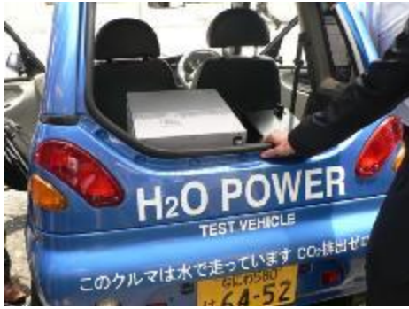
300W generation system mounted in a luggage room (left)

Genepax Co Ltd explained the technologies used in its new fuel cell system "Water Energy System (WES)," which uses water as a fuel and does not emit CO 2 .