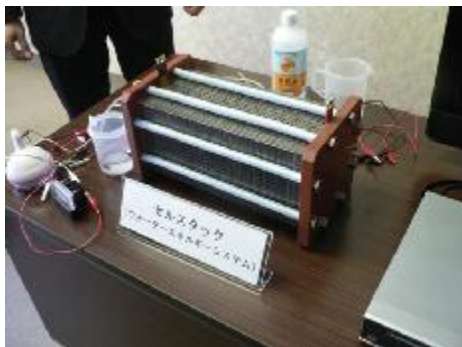
Internal portion of the 120W fuel cell stack